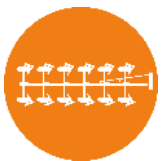
Land Preparation & Drill/Planter