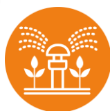
Mist / Irrigation System