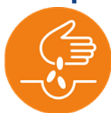
Drill / Planter