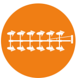
Land Preparation Equipment