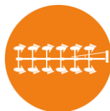
Land Preparation Equipment